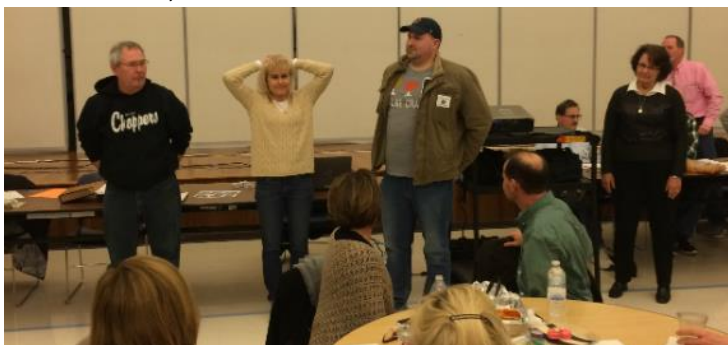
The audience had fun with "Heads or Tails"