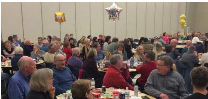
16 tables sold, 14 attended as the weather threatened